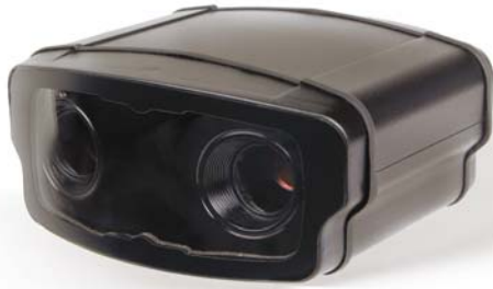
CitySync LPR Camera with Integrated Overview Camera Provides Image for CCTV